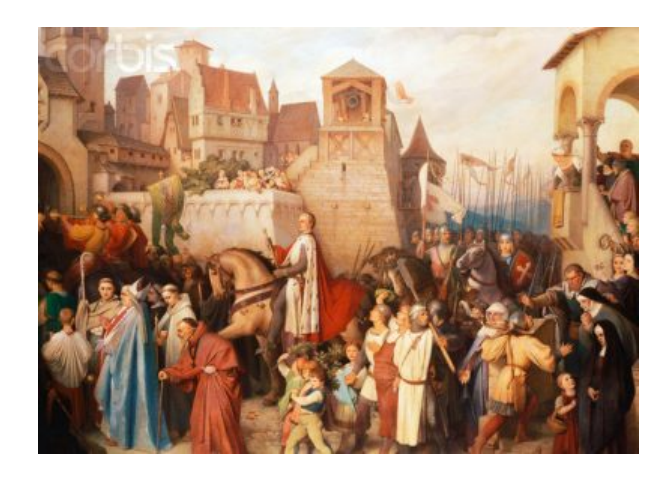
19th century — by Josef Mathias von Trenkwald

Among the many treaties signed with Muslim nations during this period was the famous <u>1797 treaty with Tripoli</u>. It was one of the many treaties in which each country officially recognized the religion of the other in an attempt to prevent further escalation into a "Holy War" [10] such as had existed between Christians and Muslims in the Middle Ages.